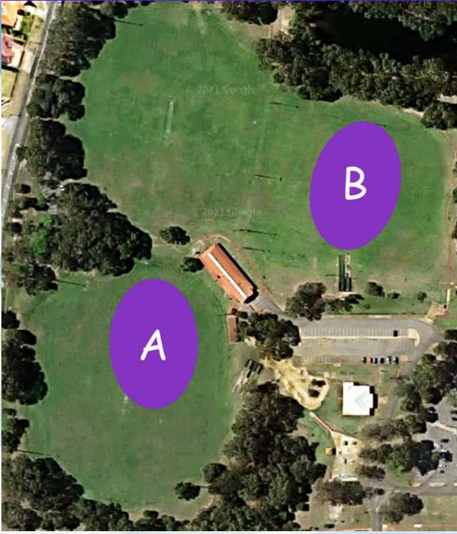
ALTONE PARK 332 Benara Road, Beechboro